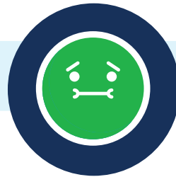
Nausea and/or vomiting