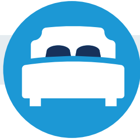
Sex with infected partners