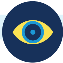
Yellowing of skin + eyes