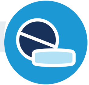
Recreational drug use

It can also be spread through close contact with someone infected with hepatitis A.