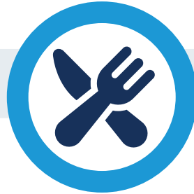
Eating/drinking contaminated food